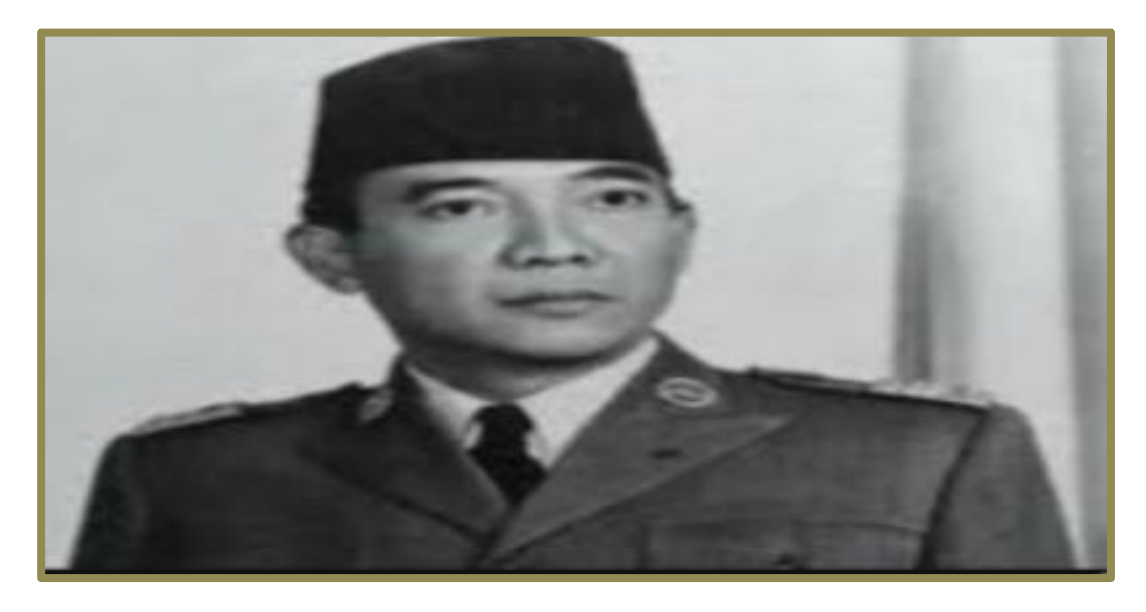
Source <a href="https://www.youtube.com/watch?v=tMDSHJnfZNA">https://www.youtube.com/watch?v=tMDSHJnfZNA</a>

After you watch the videos or listen the audio, please fill in the table below. Discuss with your partner to make more detailed information.